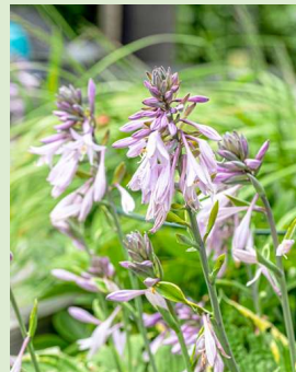
Hosta 'Diamond Tiara'