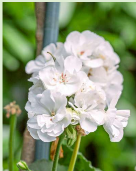
Pelargonium 'Horizon White'