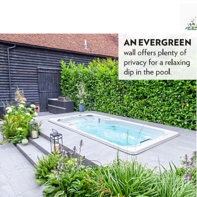
AN EVERGREEN wall offers plenty of privacy for a relaxing dip in the pool.