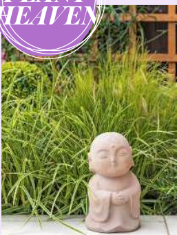
Carex oshimensis 'Evergold'

FABULOUS FOLIAGE brings no-fuss texture to the plot, the leaf shapes highlighted by curvy statues and rusting steel.