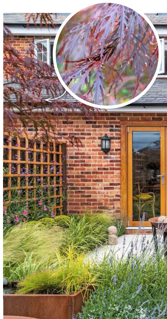
SIMPLE SPRAYS of verbena pretty up the patio table.

“Once the design was finished we saw that the back gate was very visible from the house so we decided to purchase another sheet of Corten steel,” says Alan. “And with a half-sheet left over from the initial design, we asked Cube to erect this to shield the gate from the house. That’s been really successful and hides this area from view. I also made a rustic wooden trough for plants with timber left over from the building